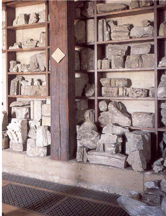
Fig 2 the 'historic collection' of medieval and classical (Inigo Jones) architectural fragments in the south triforium of the present St Paul's cathedral. The shelving dates from the 1930s

Generally it is acceptable to store stone directly on shelves. For more protection, for instance for small or fragile objects, foam sheeting can be used; but this should be a polyethylene foam such as Plastazote – other types degrade over time. If there is space, pallets on the floor are a good idea, to avoid damp.