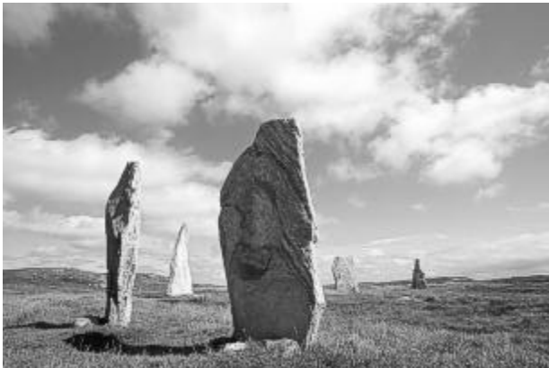
Callanish II stone circle